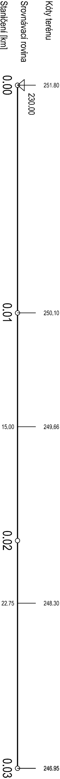
9.2. GEOLOGICKÝ ŘEZ 1-1'; měř. 1:100/100